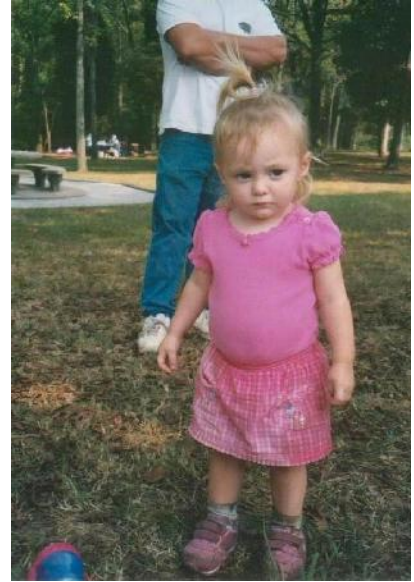
But it is all about making fishin' buddies and...